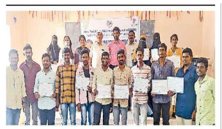
ద్రువపడ్రాలు అందుకున్న విద్యార్థులు

Date: 25/05/2023, Edition: Chittoor (Palamaner), Page: 11 Source : https://epaper.sakshi.com/